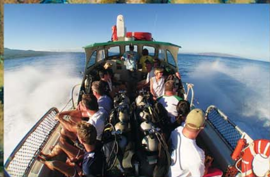
Departing from Kihei Boat Ramp.